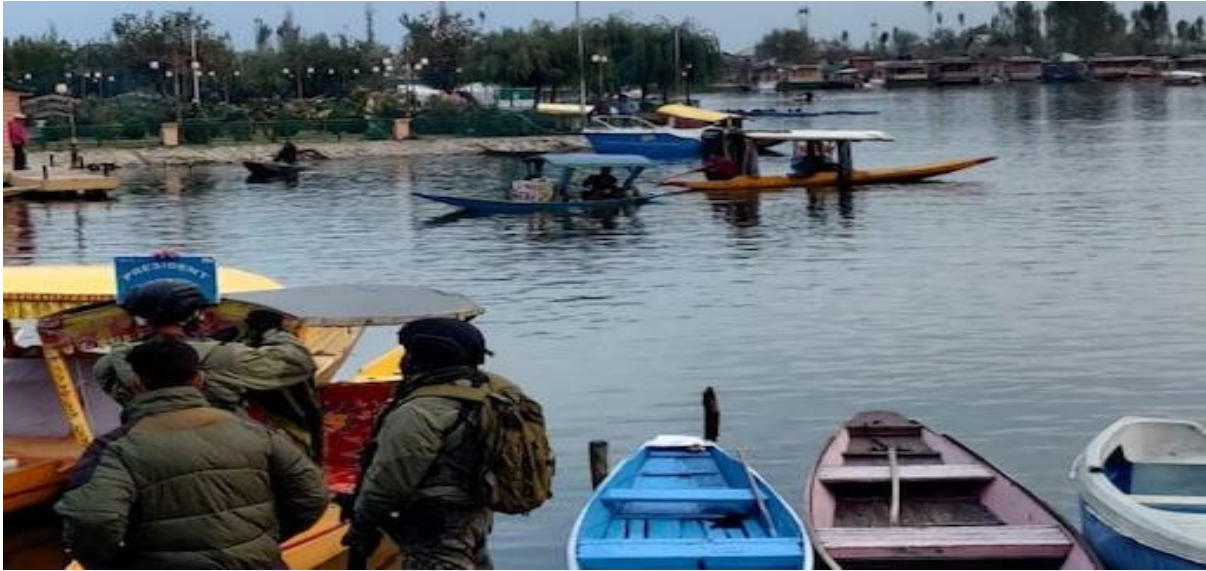
Situation on the ground in Kashmir is changing for the better.

These are the people who have been cleaning up a system that had corroded over decades, re-establishing the rule of law, introducing innovations and winning the confidence of the public.