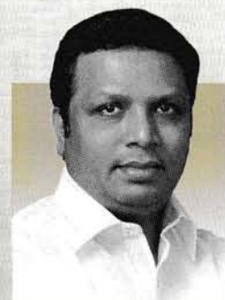
Adv. Ashish Shelar MLA, Chairman, Mumbai BJP